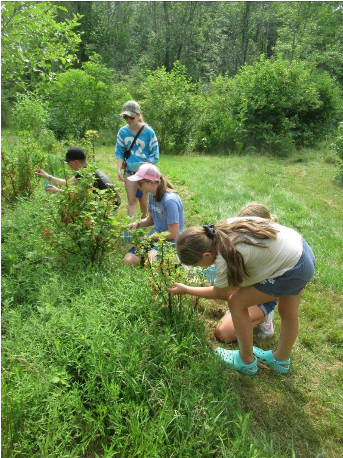
This family is enjoying a U-Pick experience in the edible forest and left with an abundant haul. as shown below